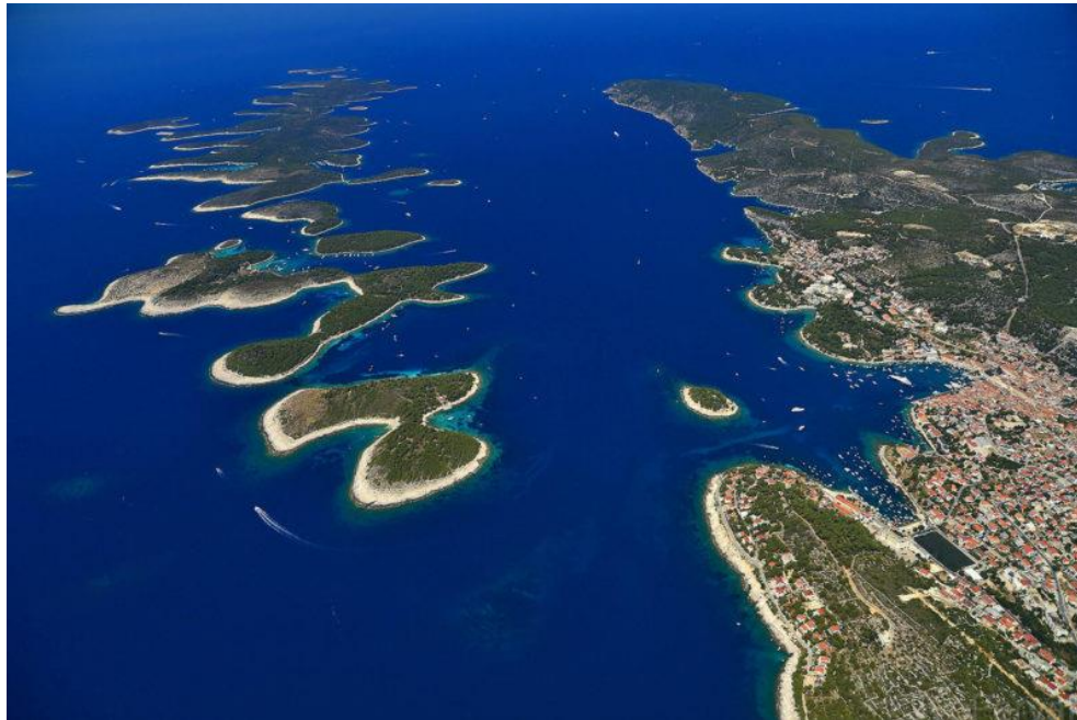
Paklini islands (left) and Hvar Island (right)

post conference excursion June 22 to June 29