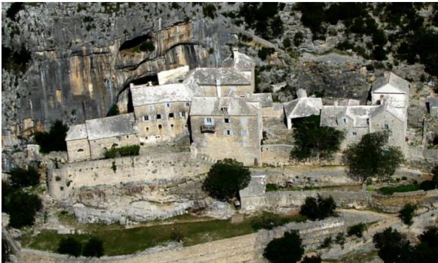
Blaca monastery with astro lab and old school

In the morning go toward Brač island, anchor in Blaca cove and visiting famous Blaca desert and monastery. To Blaca monastery we need to walk about 1h and will take packed lunch with us. In the afternoon diving, snorkeling and swimming will be organized. Going to Milna town on Brač island, dinner on vessel, walking through town, stay overnight.